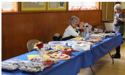
The dessert table is loaded & ready