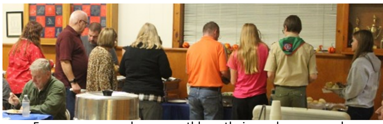
Everyone moves along smoothly as their meals are served