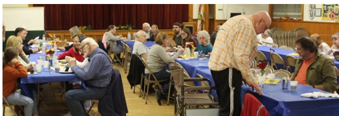
A full house of dine-in customers