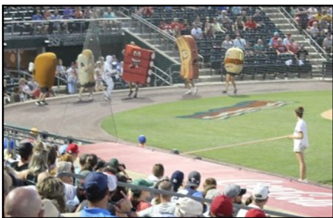
Pork Racers – no, Hambone did not win... again!